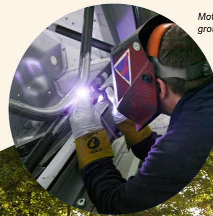
Motorsport and advanced engineering group Prodrive is based in Banbury

Bicester , Oxfordshire's eco town and home to the famous retail outlet Bicester Village, is becoming the centre of the county's low-carbon innovation. The Bicester Motion Innovation Quarter will establish a world-leading automotive engineering centre of excellence and offer new accommodation for international technology businesses.