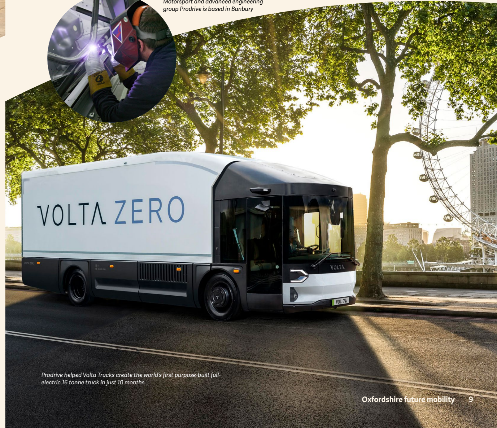
Prodrive helped Volta Trucks create the world's first purpose-built full-electric 16 tonne truck in just 10 months.