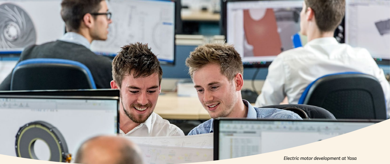
Electric motor development at Yasa

No other location worldwide offers so much relevant motorsport technology