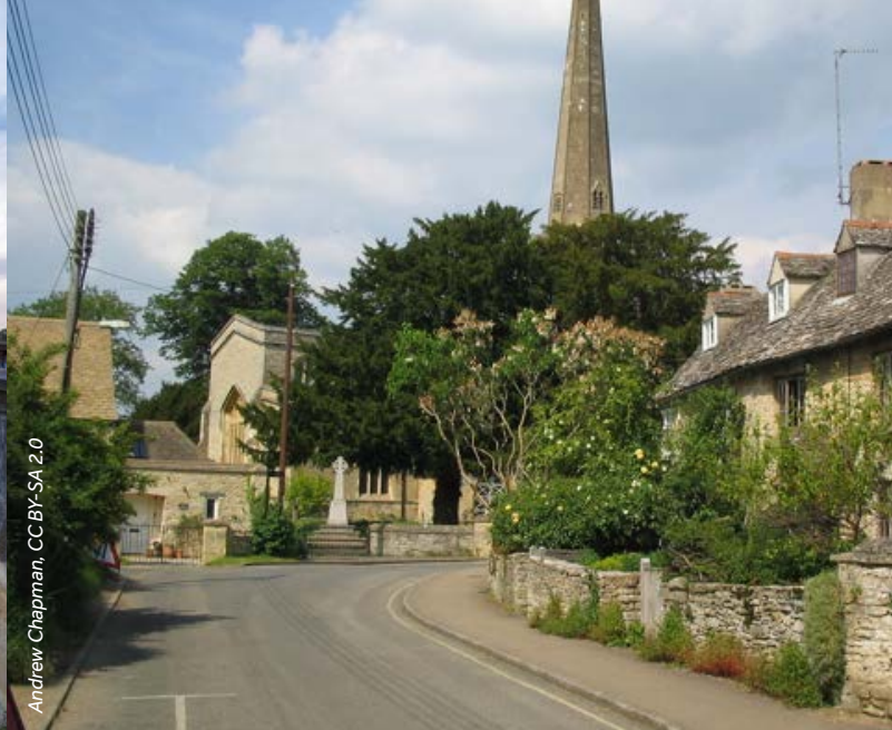
Andrew Chapman, CC BY-SA 2.0